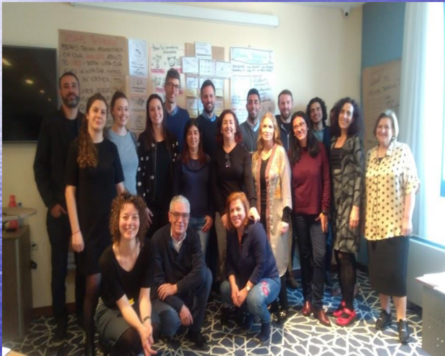
The DICE team