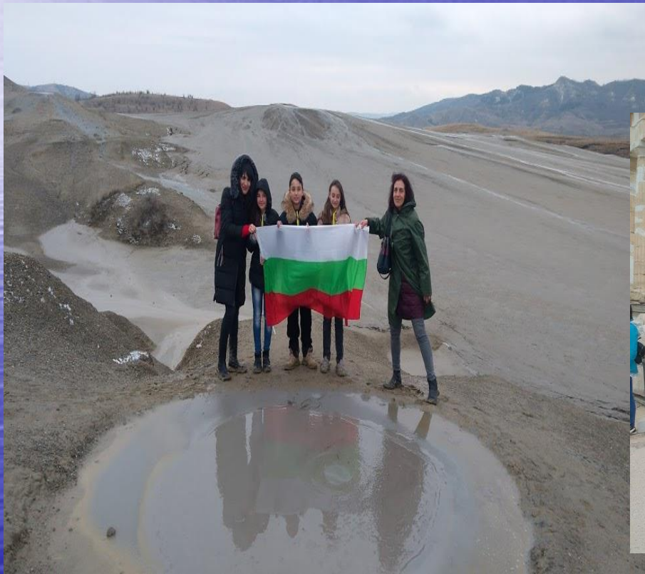
C2 – Larissa, Greece